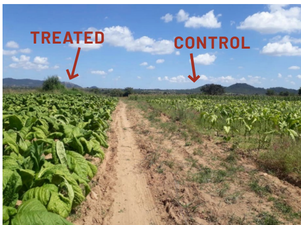
FRESH-P trial Mutoko, Zimbabwe: left field has been treated