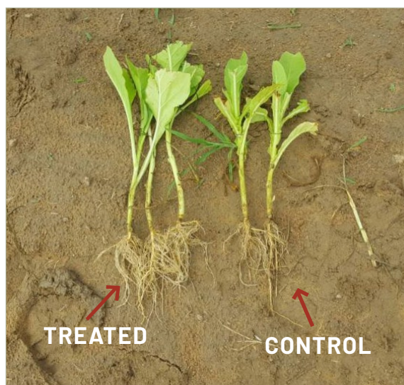
AfriKelp: Burley seedlings on left have been treated

It's formulation has recently been improved for use as a foliar on 5000Ha of wheat in Zambia this winter. Watch this space as we grow the market with our Zambian distributor – ATS Agrochemicals .